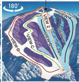
Iwatake Back Bowl